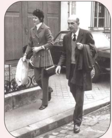
With the King in Paris in the 1960s.