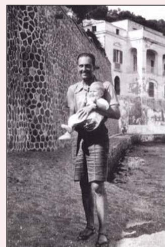
In the arms of her father at Villa Rosebery, Naples, 1935