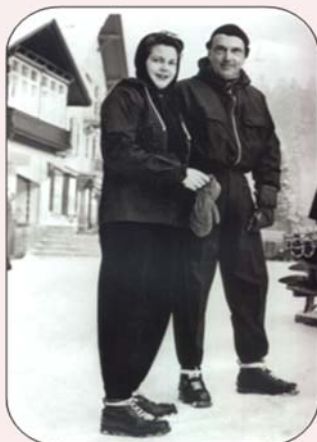
With King Umberto II in Gstaad. Winter 1956

To be separated from my father during the war when, at age 8, she left for Switzerland for two years and returned to Italy in August of 1945. She remembers seeing a war torn Italy upon her return and signs that had been put up indicating "US War Zone" which was shocking to her.