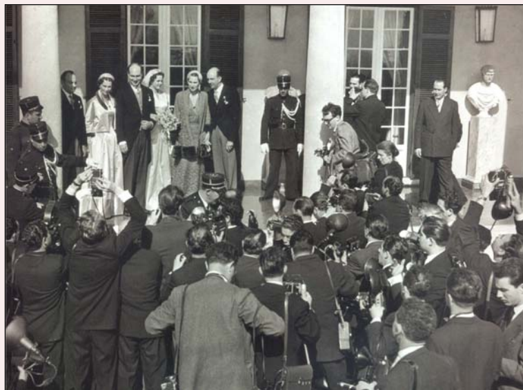
With Alexandre and our Parents at our Wedding, Cascais, February 12, 1955

In 1946, Princess Maria Pia left Italy with her family: she lived with her father and sisters in Cascais, Portugal and came to adulthood in Switzerland. In 1954, she met and later married Prince Alexander of Yugoslavia in 1955. They moved to Paris and kept in touch with other European royal families and artists. In 1958, she gave birth to fraternal twins (Prince Dimitri and Prince Michael of Yugoslavia). In 1963, two more twins were born (Prince Sergius and Princess Helene of Yugoslavia). They were together for thirteen years until their consensual divorce in 1967. She has wonderful memories of that period: