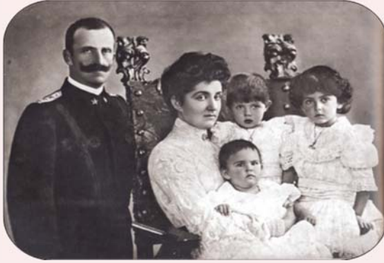
The future King Umberto II a few months old with his sisters Jolanda and Mafalda and his parents