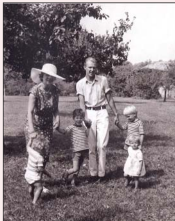
Queen Maria José and with Prince Victor Emmanuel and grandchildren. Merlinge, August 1964