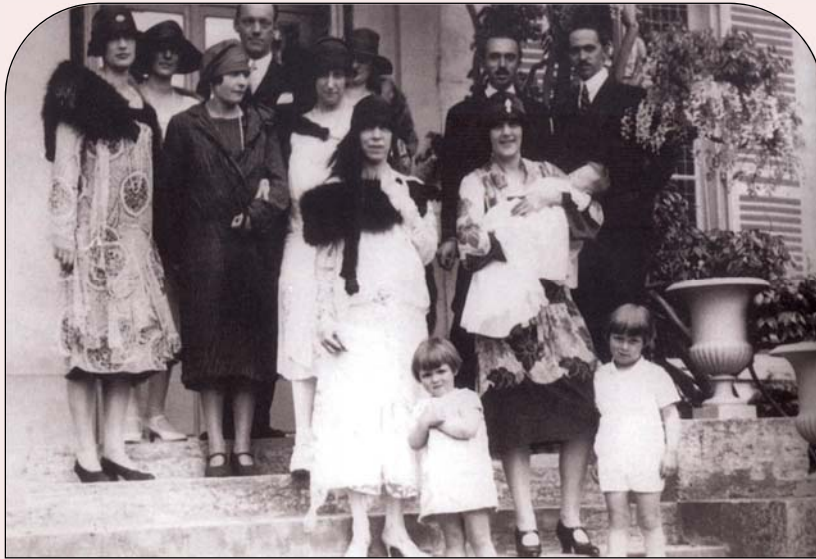
In the arms of his mother Margaretha, Princess of Denmark on his Baptism 1926. To her right is Queen Elizabeth of Belgium, his godmother and Princess Maria Pia's grandmother

various military decorations and devoted himself to more sporting, but no less perilous, endeavors. During the next three decades, the Prince distinguished himself as a successful businessman, accomplished racing driver and sailor. Among other competitions, he participated in the "24 Hours" of Le Mans and the 'Tour de France'. In the 1960's, the Prince helped develop the "Zodiac" from its original function as an inflatable, provisional life-boat into the highly versatile and dependable sea-going craft that has become ubiquitous and a great commercial success.