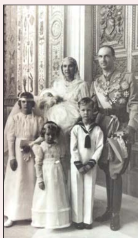
On the day of her First Communion with her parents and siblings May 10, 1943, Rome