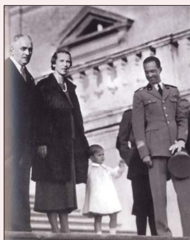
With her Mother and Father at Raconnigi Castle, at 2 years old, 1936